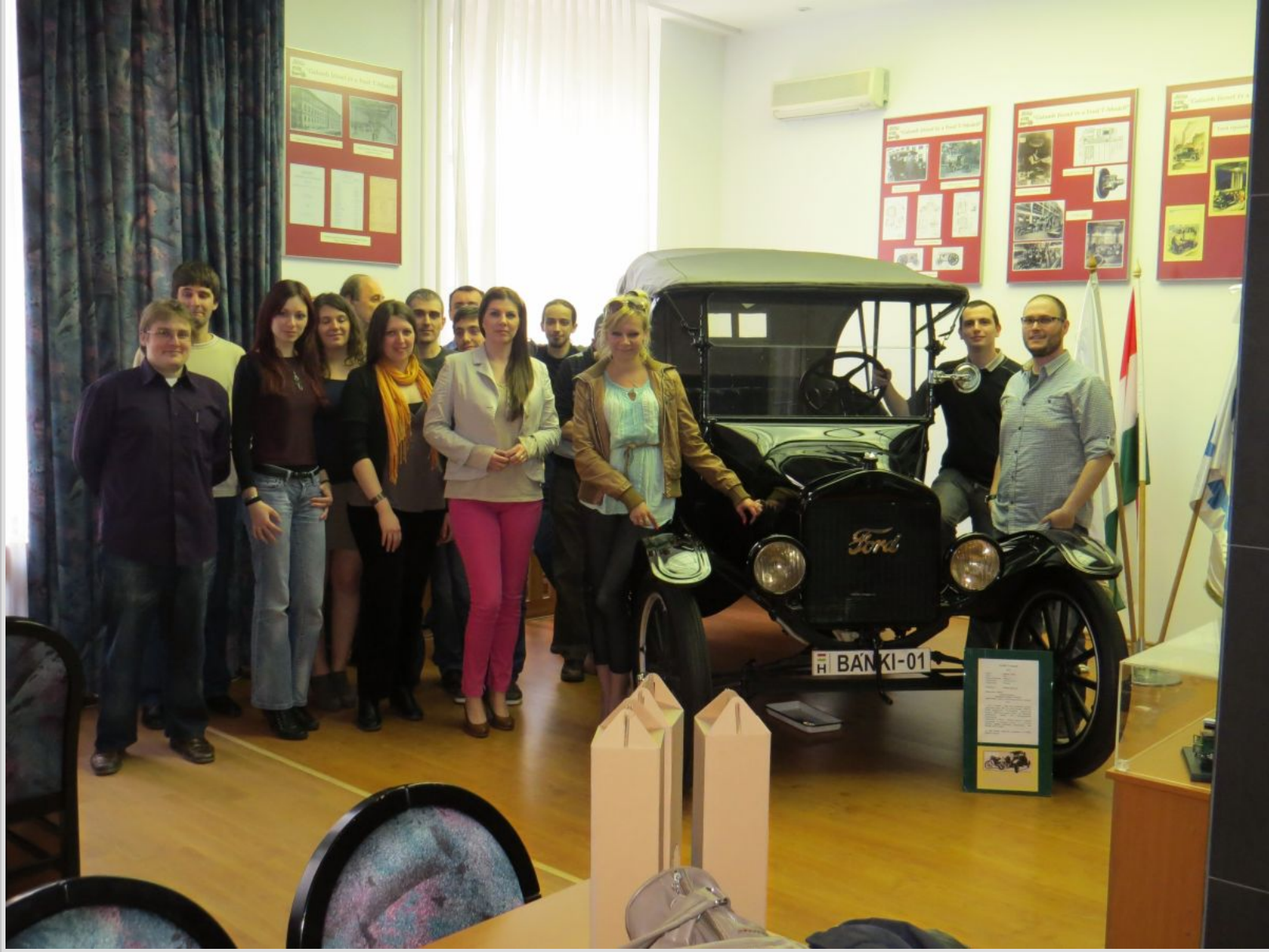
Students from Szabadka - Subotica