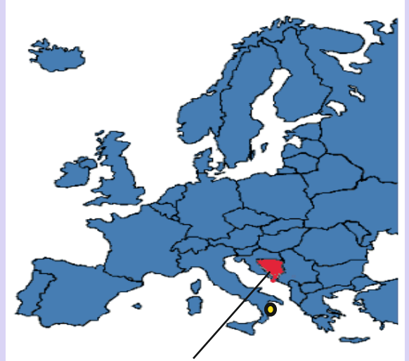
ZENICA, EMFM 2015